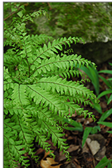
Northern Maidenhair Fern foliage