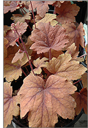
Evening Spice Foamy Bells foliage