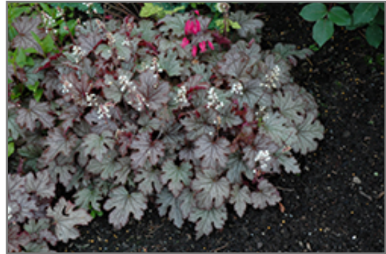
Cracked Ice Foamy Bells in bloom