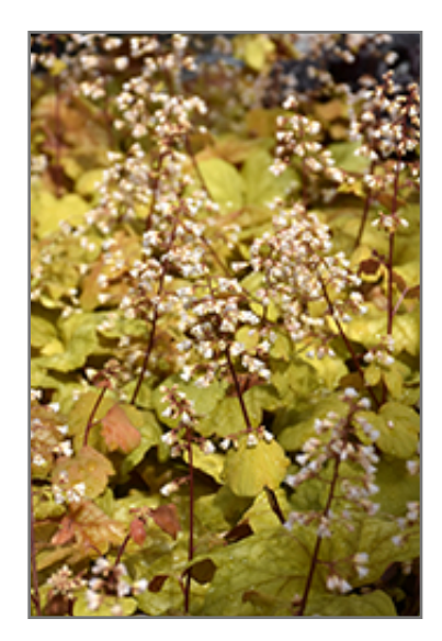
Champagne Coral Bells flowers