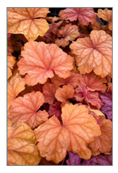
Champagne Coral Bells foliage

Champagne Coral Bells is recommended for the following landscape applications;