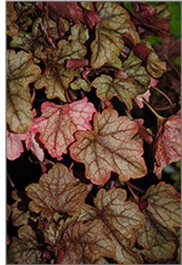
Autumn Rush Foamy Bells foliage