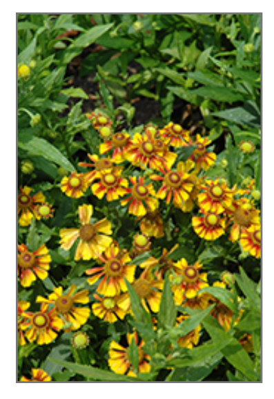
Western Mixture Sneezeweed flowers

A great fall bloomer that brightens the garden with its rich yellow and red flowers when everything else starts to fade; adapts to most soils; regular watering needed