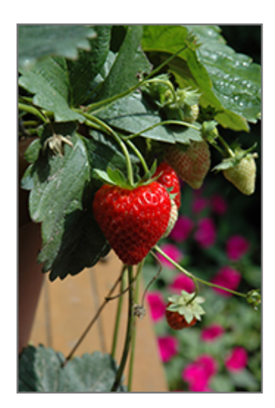
Cupido Strawberry fruit

This is an open herbaceous perennial with a spreading, ground-hugging habit of growth. Its relatively fine texture sets it apart from other garden plants with less refined foliage. This is a high maintenance plant that will require regular care and upkeep, and should not require much pruning, except when necessary, such as to remove dieback. It is a good choice for attracting birds to your yard, but is not particularly attractive to deer who tend to leave it alone in favor of tastier treats. Gardeners should be aware of the following characteristic(s) that may warrant special consideration;