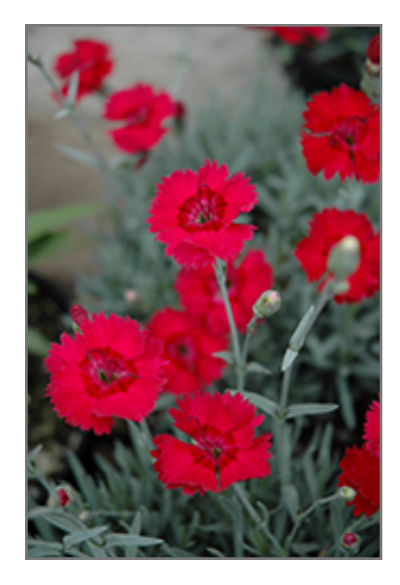
Red Beauty Pinks flowers

An eye catching garden accent, this variety blooms early in the season; silvery gray-green leaves and stems compliment the amazing lacey edged red blooms; an excellent choice for rock gardens and edging