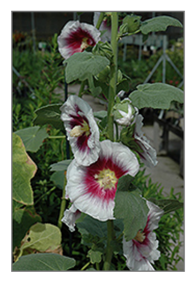
Creme de Cassis Hollyhock

Creme de Cassis Hollyhock is recommended for the following landscape applications;