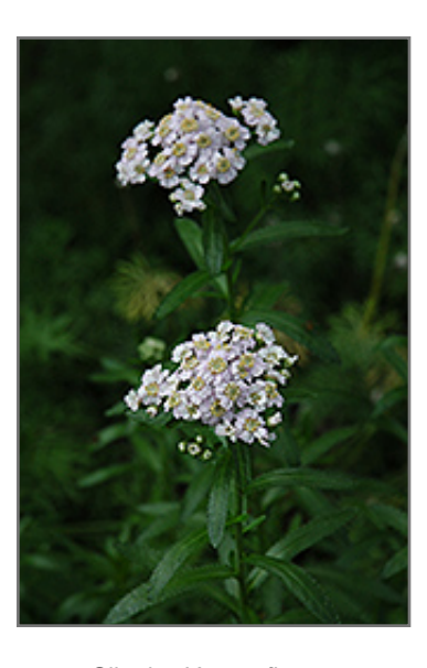
Siberian Yarrow flowers

Siberian Yarrow is smothered in stunning white flat-top flowers with buttery yellow eyes at the ends of the stems from early to late summer. The flowers are excellent for cutting. Its attractive tomentose pointy leaves remain dark green in colour throughout the season.