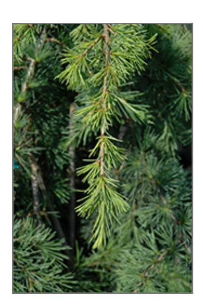
Aurea Wells Deodar Cedar foliage

Aurea Wells Deodar Cedar will grow to be about 30 feet tall at maturity, with a spread of 20 feet. It has a low canopy with a typical clearance of 2 feet from the ground, and should not be planted underneath power lines. It grows at a medium rate, and under ideal conditions can be expected to live for 80 years or more.