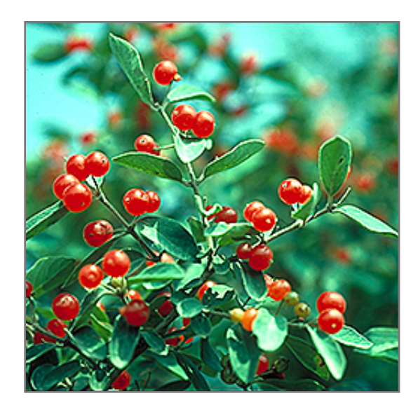
Freedom Honeysuckle fruit