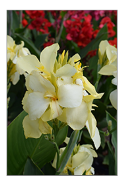
Cannova Lemon Canna flowers

This plant should only be grown in full sunlight. It requires an evenly moist well-drained soil for optimal growth, but will die in standing water. It is not particular as to soil pH, but grows best in rich soils. It is highly tolerant of urban pollution and will even thrive in inner city environments, and will benefit from being planted in a relatively sheltered location. Consider applying a thick mulch around the root zone in winter to protect it in exposed locations or colder microclimates. This particular variety is an interspecific hybrid. It can be propagated by division; however, as a cultivated variety, be aware that it may be subject to certain restrictions or prohibitions on propagation.