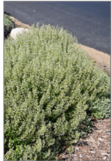
White Cloud Dwarf Calamint in bloom