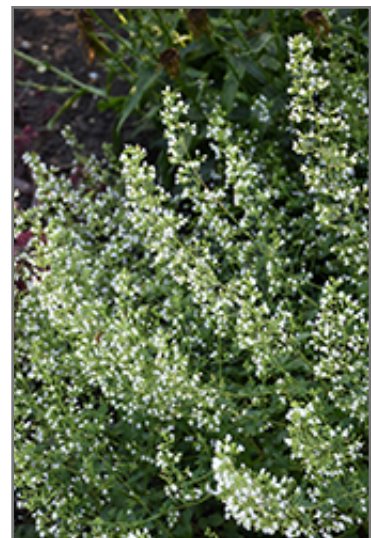
White Cloud Dwarf Calamint flowers