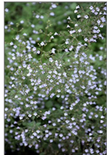
Blue Cloud Dwarf Calamint flowers