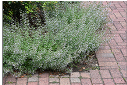
Blue Cloud Dwarf Calamint in bloom

Blue Cloud Dwarf Calamint is recommended for the following landscape applications;