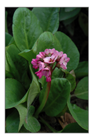
Overture Bergenia flowers