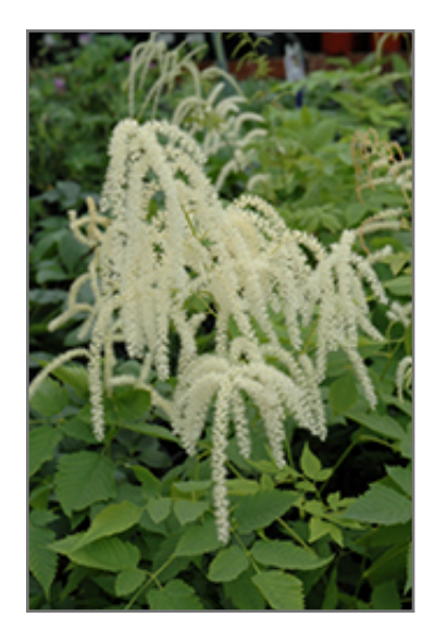
Sylvester Goatsbeard flowers