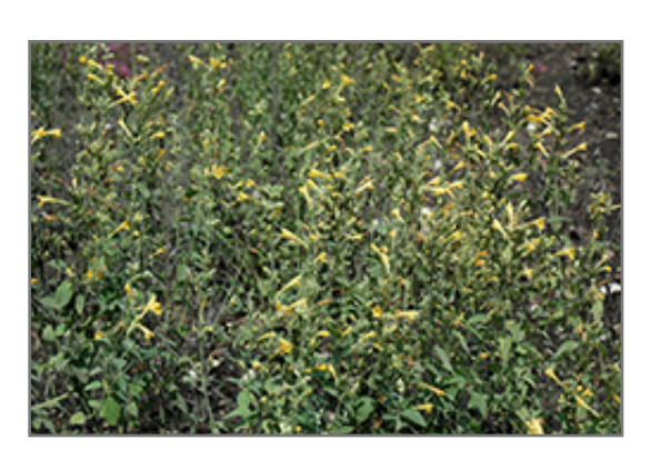
Sunset Yellow Hyssop flowers