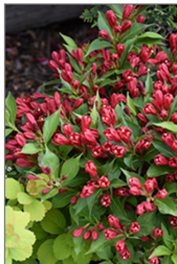
Crimson Kisses Weigela flowers