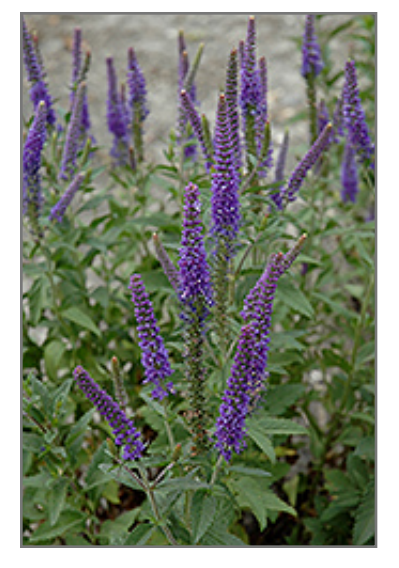
Midnight Speedwell flowers

An extremely easy to grow and virtually maintenance-free variety; flower spikes are tightly bunched and long, producing stunning blue-violet flowers from the bottom up; makes an ideal garden accent, great in rock gardens