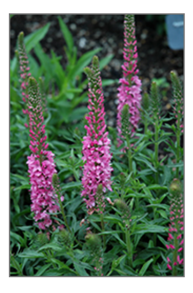
Aspire Speedwell flowers

An easy to grow variety producing deep rose-pink flowers on short, dense spikes; compact bushy habit with dark green foliage; very uniform flowering; makes an ideal small groundcover, great in rock gardens