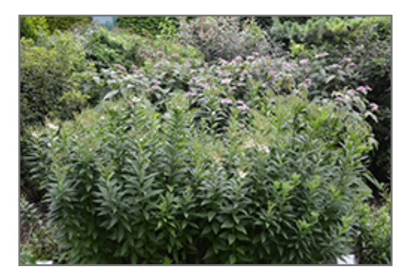
White Lightning Ironweed flowers

This is a relatively low maintenance plant, and should be cut back in late fall in preparation for winter. It is a good choice for attracting bees and butterflies to your yard. It has no significant negative characteristics.