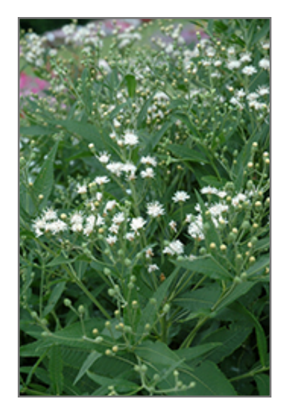
White Lightning Ironweed flowers

White Lightning Ironweed is an herbaceous perennial with an upright spreading habit of growth. Its relatively fine texture sets it apart from other garden plants with less refined foliage.