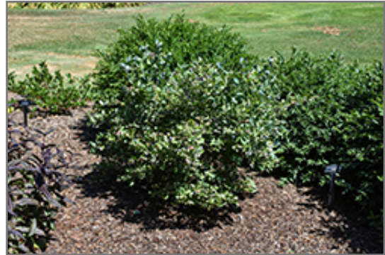
Pink Icing Blueberry