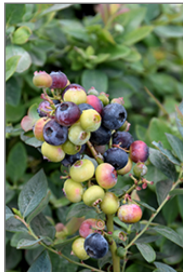
Pink Icing Blueberry fruit

Pink Icing Blueberry features dainty clusters of white bell-shaped flowers with shell pink overtones hanging below the branches in mid spring, which emerge from distinctive pink flower buds. It has bluish-green deciduous foliage which emerges pink in spring. The glossy oval leaves turn an outstanding aqua bluish-green in the fall. It features an abundance of magnificent blue berries in mid summer.