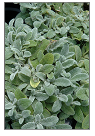
Silky Fleece Lamb's Ears foliage

This dwarf variety forms a dense low carpet of soft and fuzzy silver-green leaves bearing upright spikes of lavender flowers in early summer; clip spent blooms to tidy up for rest of season; drought tolerant once established; evergreen in mild areas