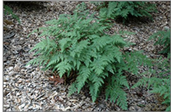
Braun's Spikemoss

Other Names: Arborvitae Fern, Clubmoss, Chinese Lace Fern