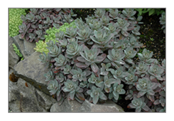
Marina Stonecrop

Marina Stonecrop is a dense herbaceous evergreen perennial with an upright spreading habit of growth. Its relatively coarse texture can be used to stand it apart from other garden plants with finer foliage.