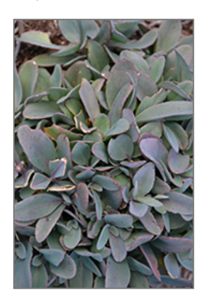
Marina Stonecrop foliage

This is a relatively low maintenance plant, and is best cleaned up in early spring before it resumes active growth for the season. It is a good choice for attracting butterflies to your yard, but is not particularly attractive to deer who tend to leave it alone in favor of tastier treats. It has no significant negative characteristics.