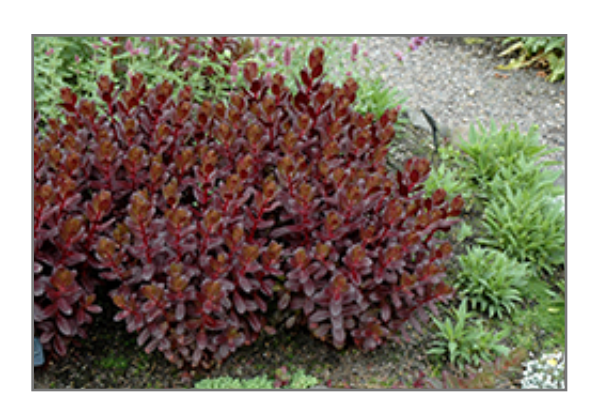
Touchdown Teak Stonecrop

Touchdown Teak Stonecrop is a dense herbaceous perennial with an upright spreading habit of growth. Its medium texture blends into the garden, but can always be balanced by a couple of finer or coarser plants for an effective composition.