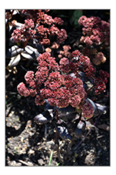
Touchdown Teak Stonecrop flowers