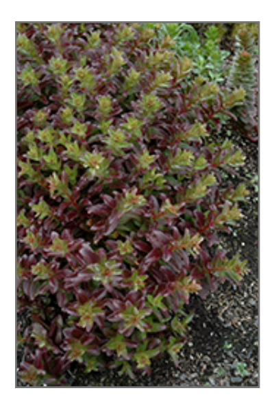
Touchdown Flame Stonecrop

Touchdown Flame Stonecrop is a dense herbaceous perennial with an upright spreading habit of growth. Its medium texture blends into the garden, but can always be balanced by a couple of finer or coarser plants for an effective composition.