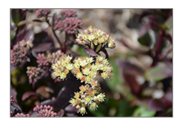
Touchdown Flame Stonecrop flowers