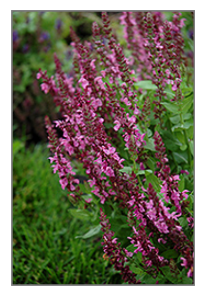
Sensation Deep Rose Meadow Sage flowers

A low, compact, and bushy variety with pretty spikes of long lasting deep rose flowers from dark pink buds; somewhat drought tolerant; excellent for the sunny border or containers