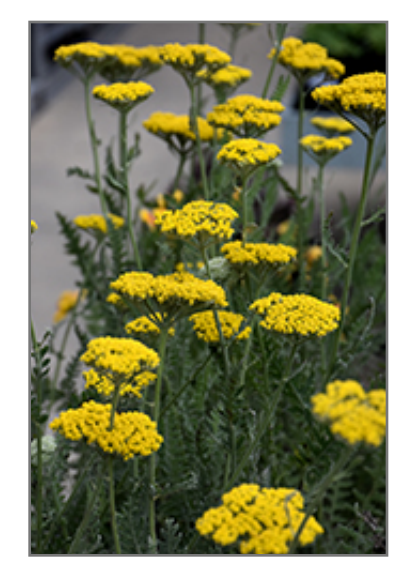
Coronation Gold Yarrow flowers