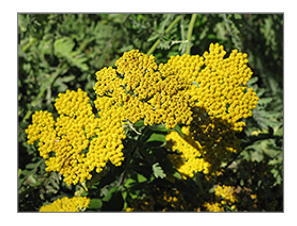
Coronation Gold Yarrow flowers