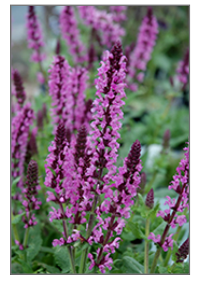
Raspberry Ruby Sage flowers

A very floriferous variety with stunning spikes of long lasting pink-raspberry red flowers in summer; deadheading encourages re-blooming; somewhat drought tolerant; excellent for the sunny border or containers