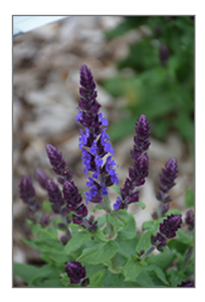
Merleau Blue Sage flowers