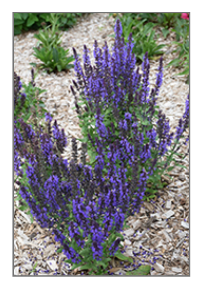
Merleau Blue Sage in bloom