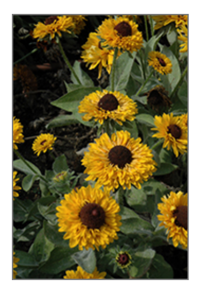
Maya Coneflower flowers

This compact variety produces large, fully double golden yellow daisies with dark brown eyes; makes an outstanding cut flower; deadhead for re-blooming; drought tolerant once established; wonderful along borders or in containers