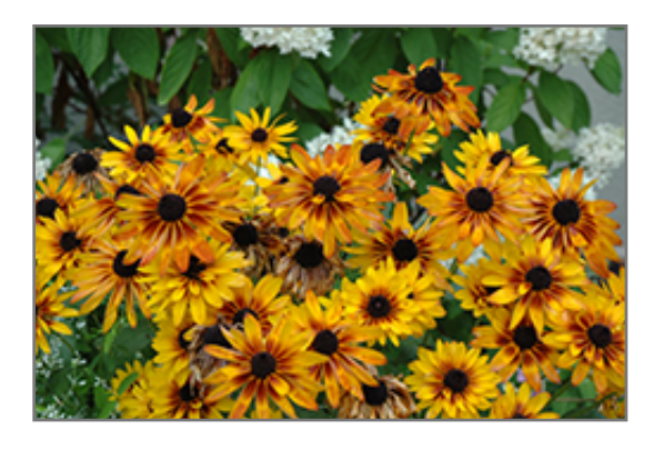
Gold Rush Coneflower flowers