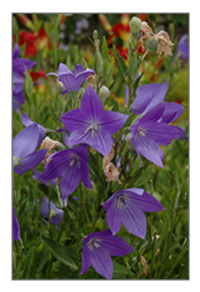
Fuji Blue Balloon Flower flowers