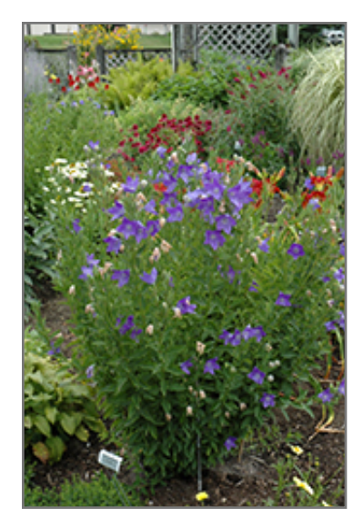
Fuji Blue Balloon Flower in bloom