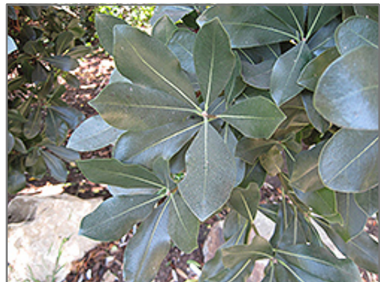
Cape Cheesewood foliage