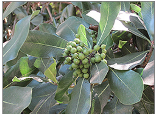
Cape Cheesewood fruit

Cape Cheesewood is recommended for the following landscape applications;