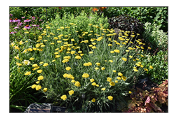
Altgold Yarrow in bloom