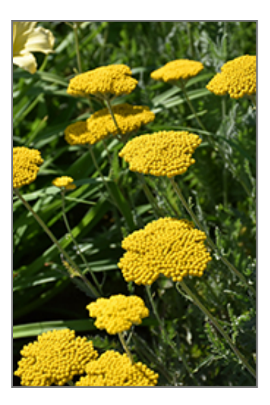
Altgold Yarrow flowers