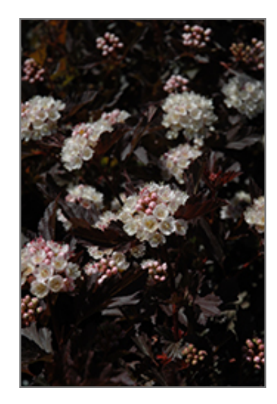
Tiny Wine Ninebark flowers

This shrub will require occasional maintenance and upkeep, and can be pruned at anytime. It has no significant negative characteristics.