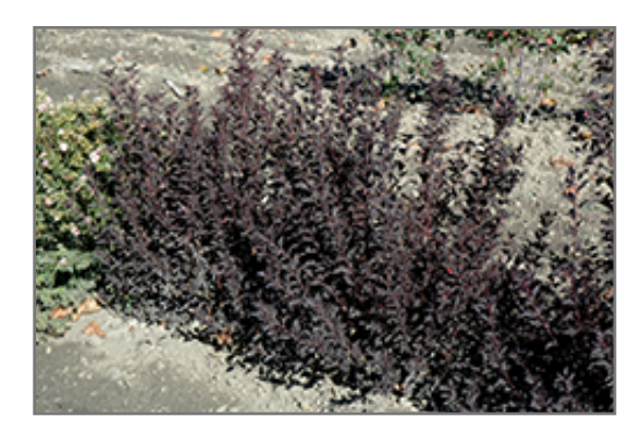
Tiny Wine Ninebark

This shrub does best in full sun to partial shade. It is very adaptable to both dry and moist locations, and should do just fine under average home landscape conditions. It is not particular as to soil type or pH. It is highly tolerant of urban pollution and will even thrive in inner city environments. This is a selection of a native North American species.