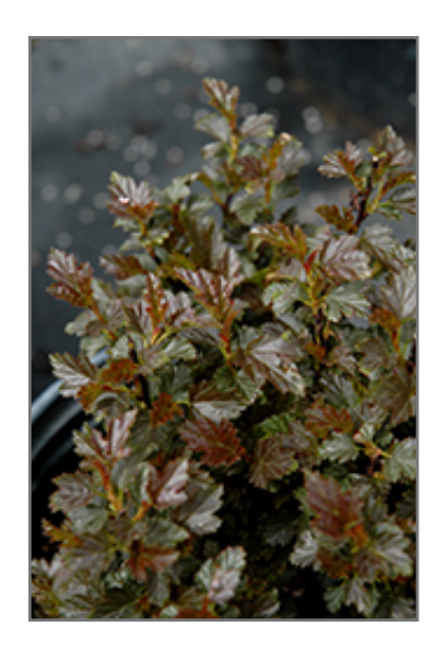
Tiny Wine Ninebark foliage