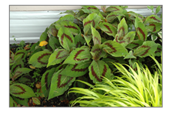
Brushstrokes Persicaria