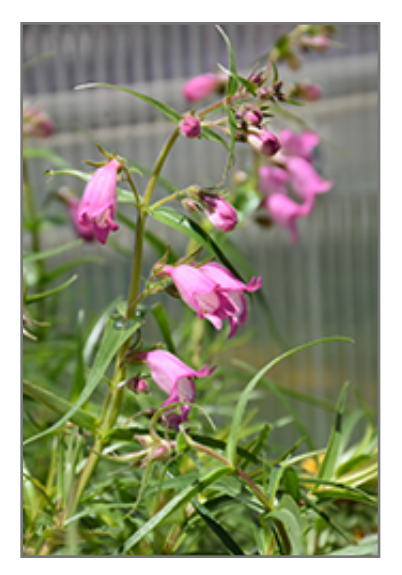
Carolyn's Hope Beard Tongue flowers

A pretty variety with a compact habit; lovely pink flowers with white throats, rising above green foliage makes a beautiful visual impact when massed in the garden, along walkways, or in borders