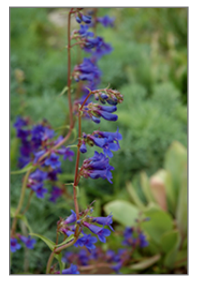
Grand Mesa Beard Tongue flowers

An outstanding variety with a tidy habit; brilliant blue flowers rising above green foliage makes a blazing visual impact when massed in the garden, along walkways, or in borders