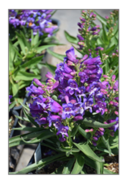
Rock Candy Blue Beard Tongue flowers

A vigorous and attractive compact plant with large eye-catching bluish-purple flowers with striped white throats; stunning as a complement to pastel yellow perennials; great for border fronts and along walkways