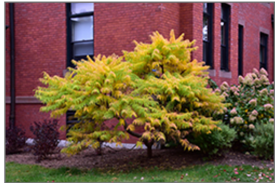
Tiger Eyes Sumac in fall