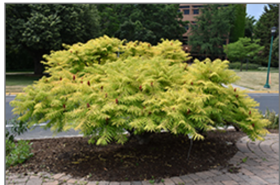
Tiger Eyes Sumac