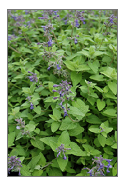
Limelight Catmint flowers

Limelight Catmint is recommended for the following landscape applications;