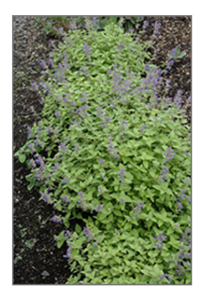
Limelight Catmint in bloom