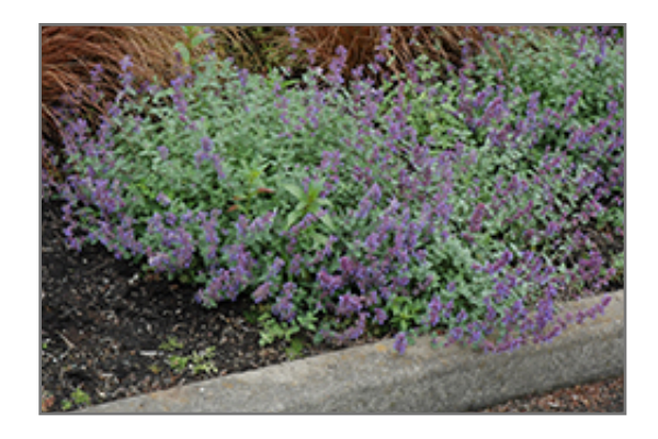
Felix Catmint in bloom