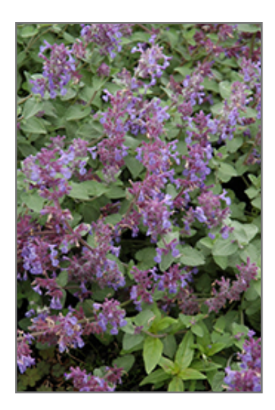
Felix Catmint flowers

This plant will require occasional maintenance and upkeep, and is best cleaned up in early spring before it resumes active growth for the season. It is a good choice for attracting bees and butterflies to your yard, but is not particularly attractive to deer who tend to leave it alone in favor of tastier treats. Gardeners should be aware of the following characteristic(s) that may warrant special consideration;