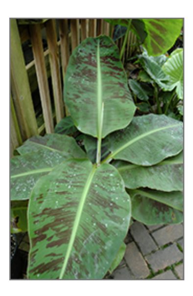
Dwarf Cavendish Banana foliage

Bananas are curious plants in a botanical sense. Strictly speaking they are perennials, with individual shoots rising up from underground rhizomes and maturing in one to two years, then ultimately dying after producing fruit, to be replaced by new shoots from the base. However, given their ultimate size and coarseness they almost behave as small trees in the landscape. This plant should only be grown in full sunlight. It does best in average to evenly moist conditions, but will not tolerate standing water. It is not particular as to soil type or pH. It is somewhat tolerant of urban pollution. This particular variety is an interspecific hybrid.