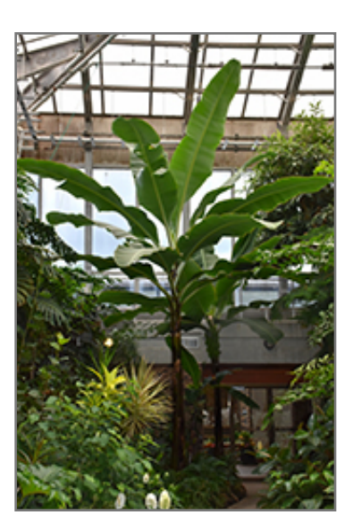
Dwarf Cavendish Banana