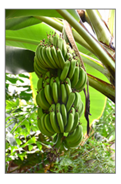
Dwarf Cavendish Banana fruit

Dwarf Cavendish Banana is recommended for the following landscape applications;