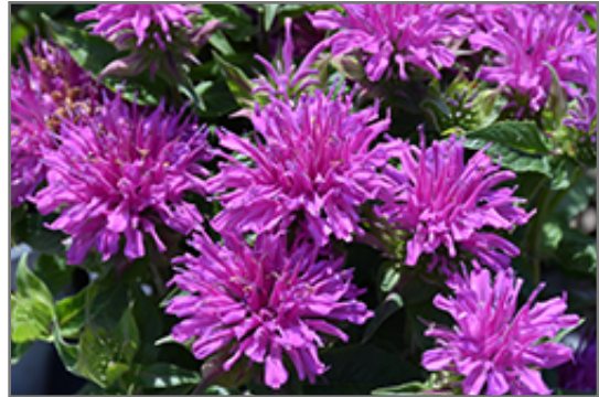
Balmy Lilac Beebalm flowers

A petite form of bee balm that produces multitudes of striking lilac and white flowers in late spring through summer; this very compact form is mildew resistant as well; great for massing in the front of borders