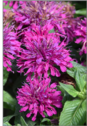
Grape Gumball Beebalm flowers

Grape Gumball Beebalm is recommended for the following landscape applications;