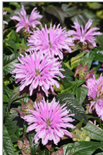
Cotton Candy Beebalm flowers

Cotton Candy Beebalm is recommended for the following landscape applications;