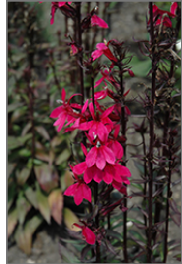
Starship Deep Rose Lobelia flowers

Starship Deep Rose Lobelia is recommended for the following landscape applications;